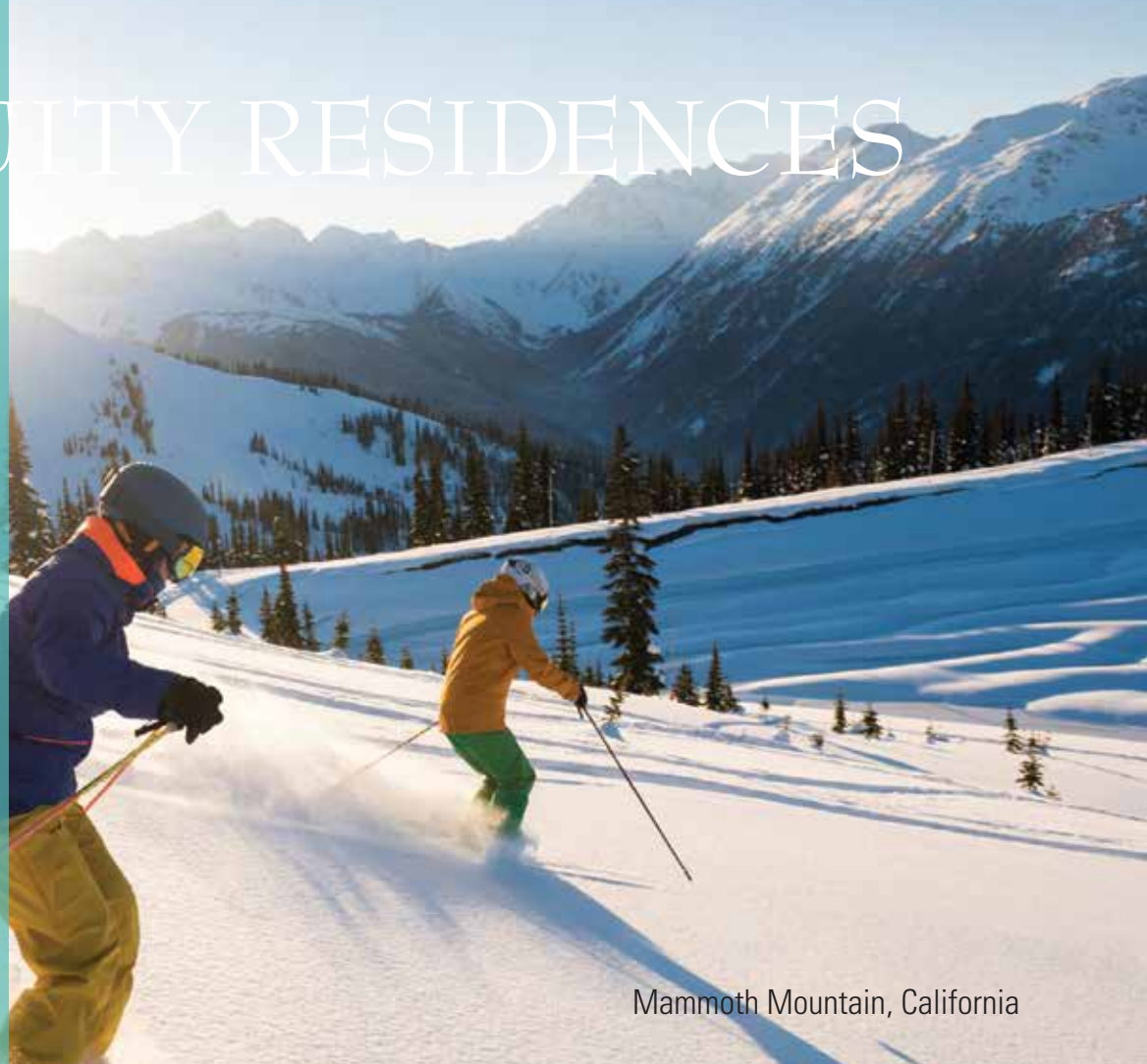
Mammoth Mountain, California